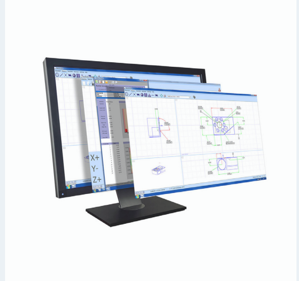
Aberlink 3D Metrology software