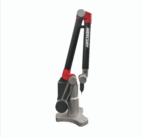
Tomelleri MERCURY Measuring arm

The Tomelleri measuring arm package not only provides the measurement arm and metrology software by Aberlink, its also includes full installation and training.