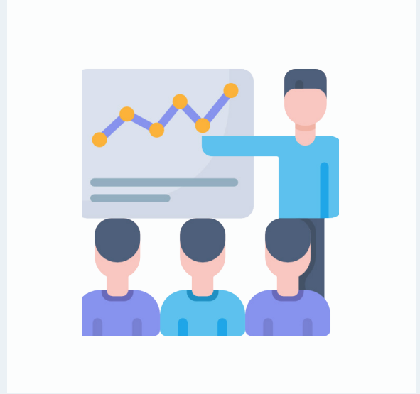
Installation & Training